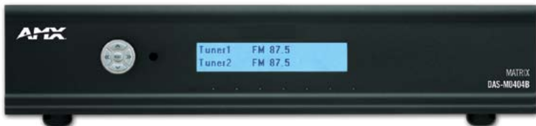
FRONT OF CONTROLLER

The Mi Series Audio Controller is a feature rich product designed with a focus on reliability, flexibility, performance, and ease of use. The system is tailored to a homeowner's current needs, and can grow with the home and family. The Mi Series modular design is engineered for future technologies so that adding zones, upgrading to LCD Touch Screen keypads, and adding a tuner module or network interface card can be easily accommodated.