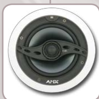
BUILT-IN SWT WITH IR SPEAKER CONTROL