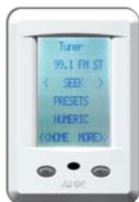
LCD TOUCH SCREEN CONTROL

AMX Distributed Audio brings you the next generation of multi-room audio. Supported by our exclusive Speaker Wire Technology (SWT), Mi Series offers significantly enhanced drive capability, enhanced audio performance, LCD Touch Screen control, and Network Interface Card, enabling you to control your entire system from any PC on your home network.