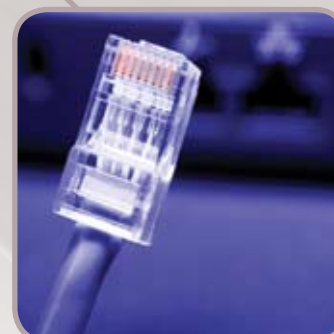
FULLY INTEGRATED ETHERNET CONTROL