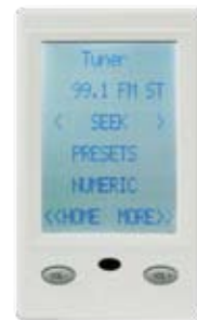
LCD SURFACE MOUNT TOUCH SCREEN (available in white only)