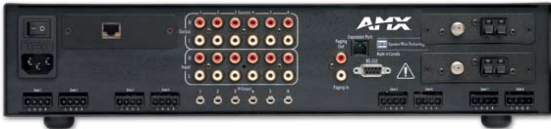
BACK OF CONTROLLER