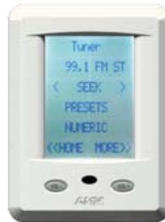
LCD FLUSH MOUNT TOUCH SCREEN