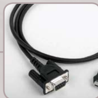
HOME AUTOMATION CONTROL