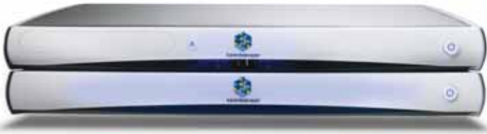
The Kaleidescape System

The Kaleidescape System has virtually unlimited expansion capabilities. Whether you own thousands of movies and albums, or have dozens of rooms on your yacht, the Kaleidescape System was designed to satisfy even the most acquisitive entertainment aficionado.