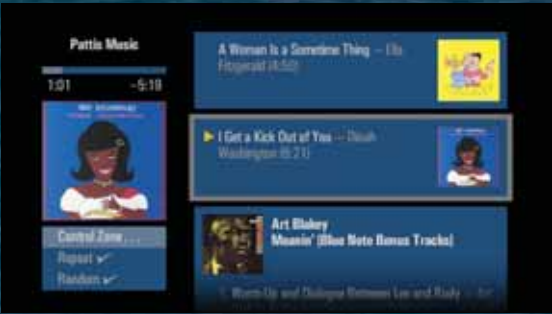
Music Now Playing