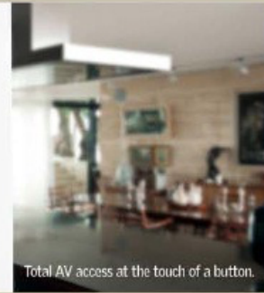
Total AV access at the touch of a button.