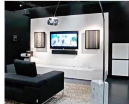
Artcoustic on-wall speakers adjacent to TV.

A number of companies have spent some considerable effort in addressing the 'invisible speaker' issue. Artcoustic make flatpanel speakers designed to offer hi-fi quality, with a choice of frame colours and interchangeable front screens to complement your interior, whilst Amina speakers are designed to be literally plastered into the wall, leaving nothing on show.