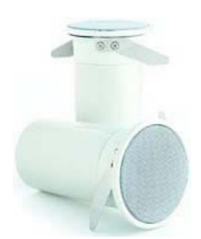
The Linn Sweetspot in-ceiling speakers.