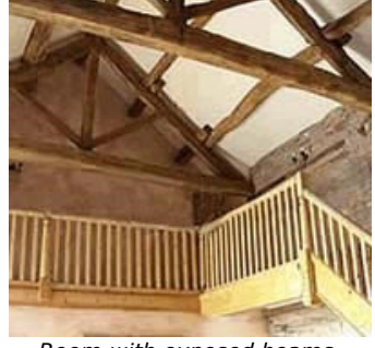
Room with exposed beams.

More modern new-build homes may allow for in-ceiling and in-wall speakers, complete with back boxes and colour-coded grilles for the ultimate bespoke and discreet installation. The only question in this scenario is the time-old dilemma of cost and size versus performance - do you spend a huge amount of money and integrate very large speakers to get music into the bathroom, or do you use speakers the same size as the halogen downlighters to get background music? The old farmhouse will most likely have solid walls and exposed beams - great for aesthetics but leaving very little option for hidden speakers. This scenario poses the biggest challenge for the custom installer - do the clients want floorstanding or bookshelf speakers, wallmounted or even on-wall speakers? Getting all parties to agree can be time-consuming and a test of negotiating skills!