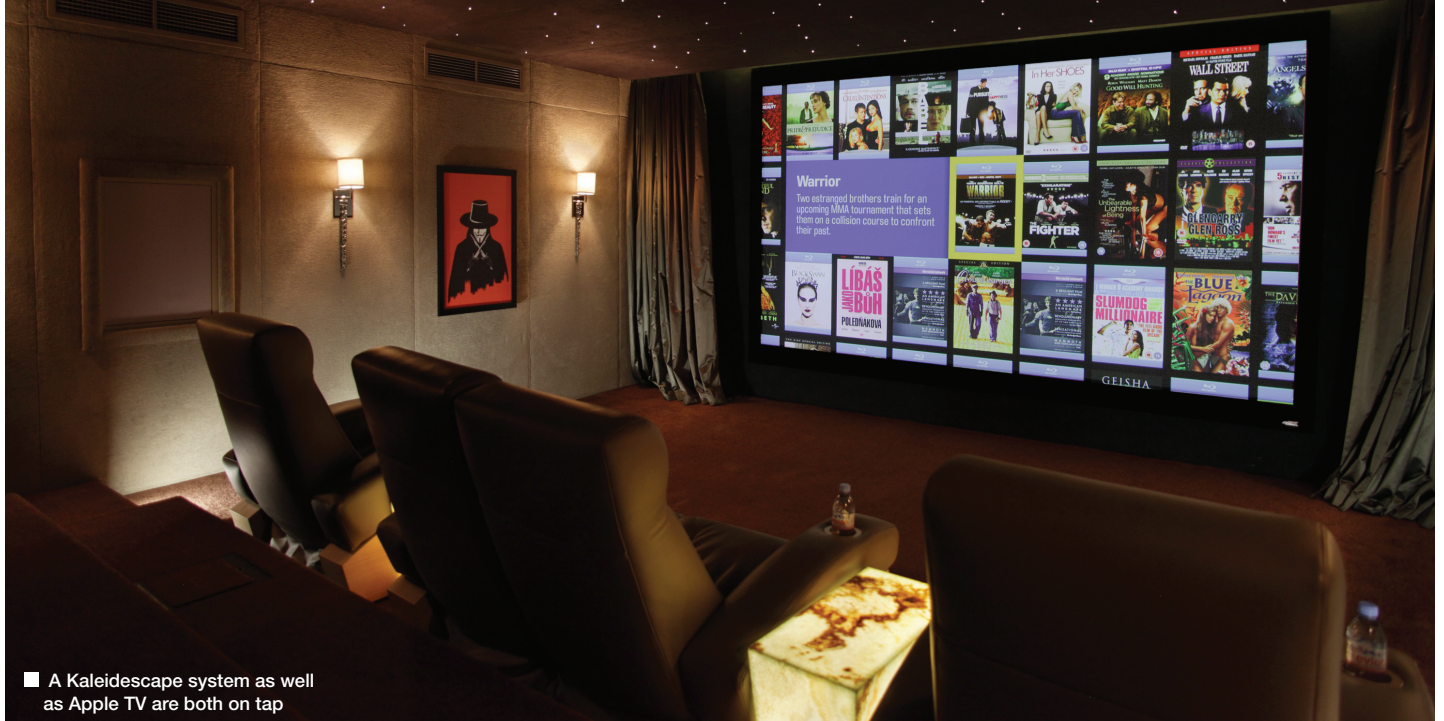
■ A Kaleidescape system as well as Apple TV are both on tap

As part of a larger whole house project in one of the most sort after districts in Dubai, Custom Controls, joined forces with Anthem AV Solutions and Artcoustic to pool knowledge and create a really attractive and feature rich home cinema.