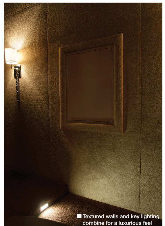
■ Textured walls and key lighting combine for a luxurious feel

The uncompromising nature of the home cinema meant that the actual room had to be designed from the ground up to give the best possible audio video experience. The room shape was remodelled to an ultimate 'trapagon' to create the ideal listening environment. A trapagon has front and end walls in parallel, but the walls taper out front to rear.